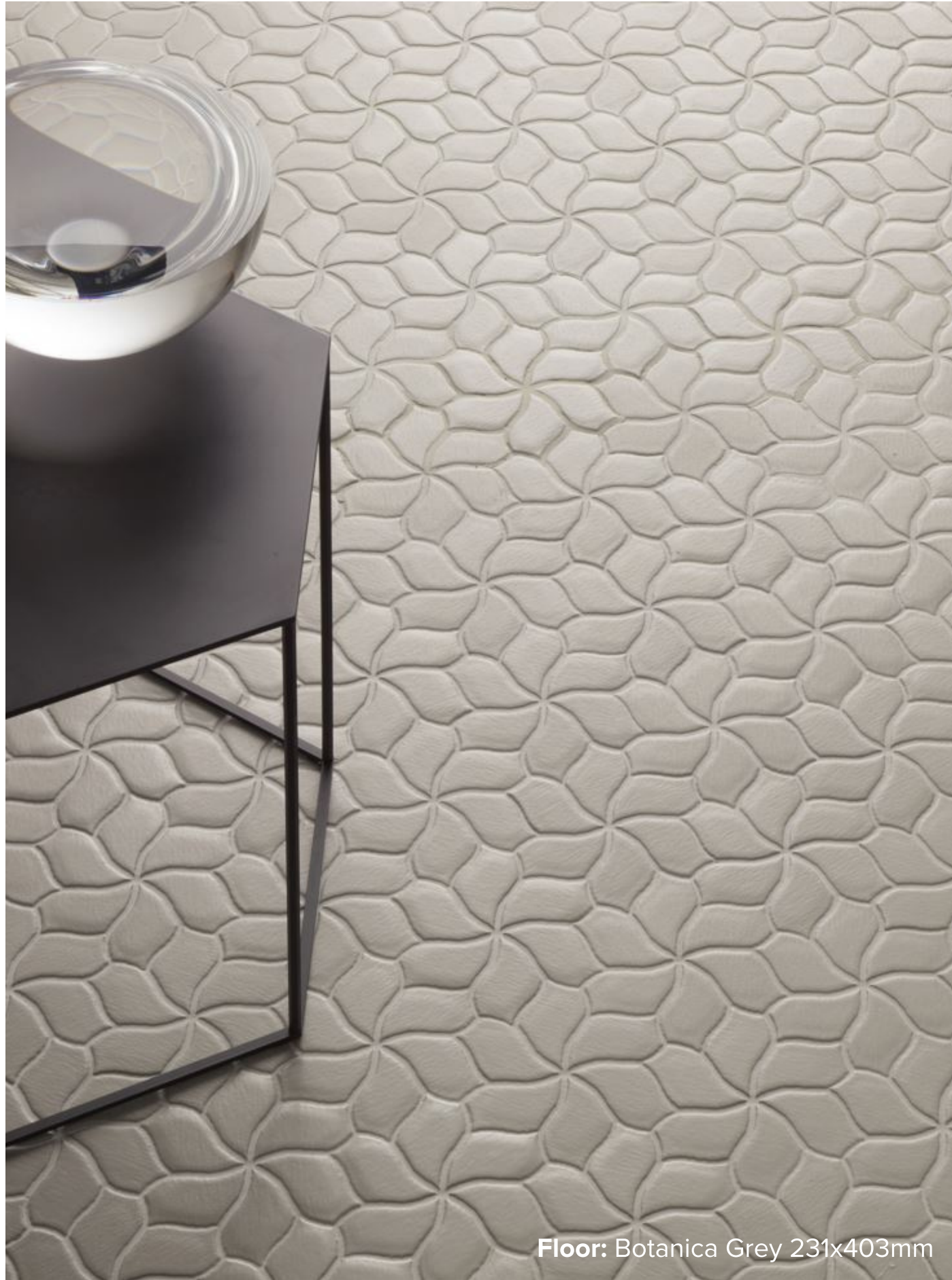
Floor: Botanica Grey 231x403mm