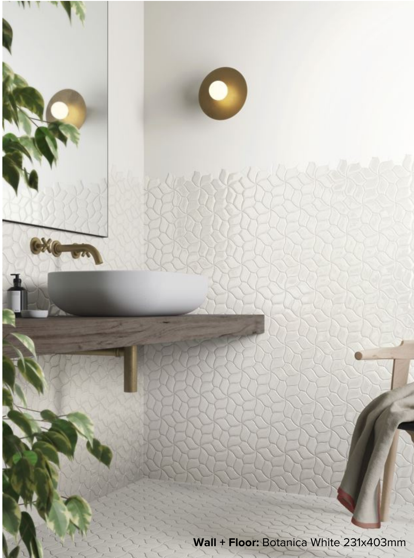
Wall + Floor: Botanica White 231x403mm