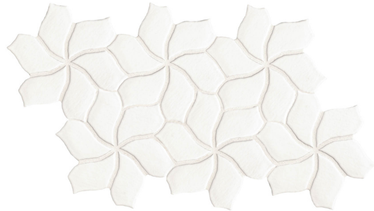
231x403mm NON-RECTIFIED 1924