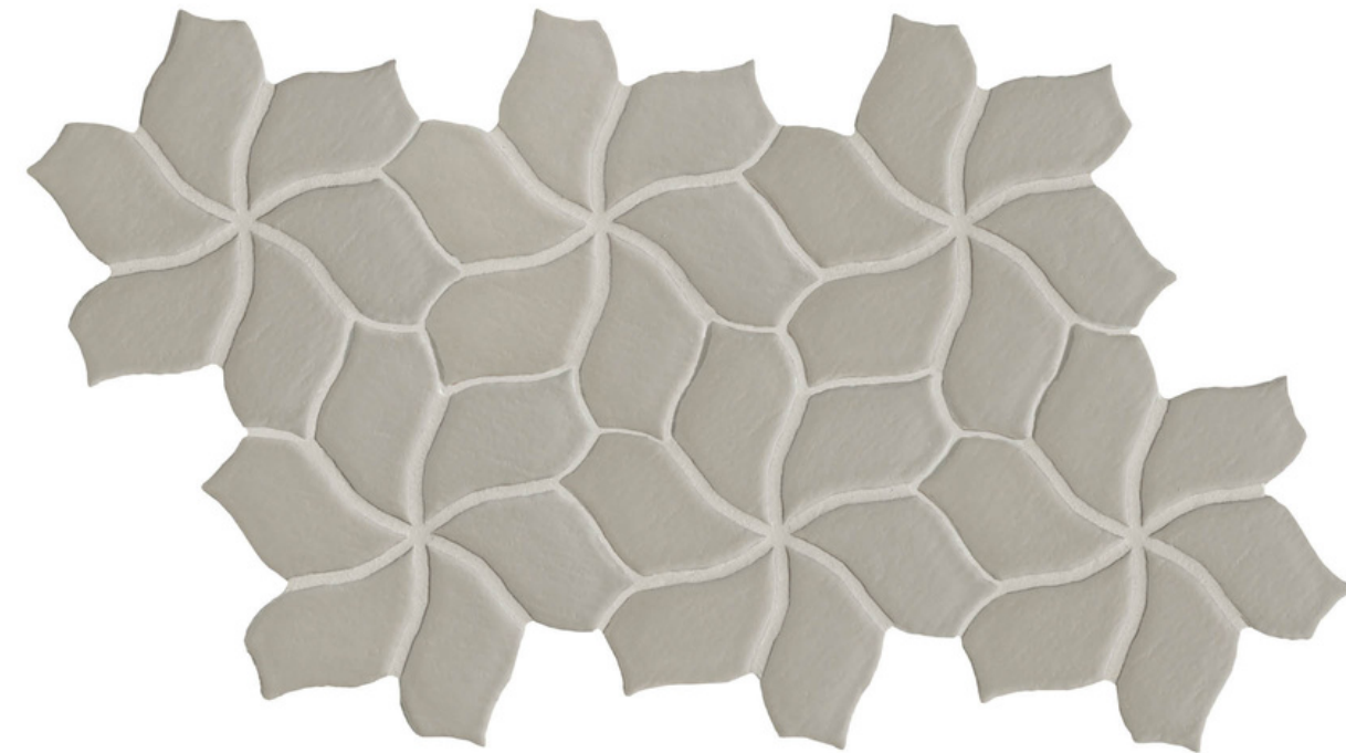
231x403mm NON-RECTIFIED 1923