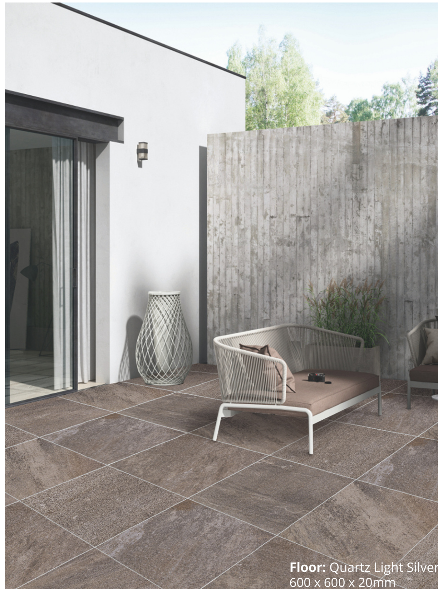
Floor: Quartz Light Silver 600 x 600 x 20mm