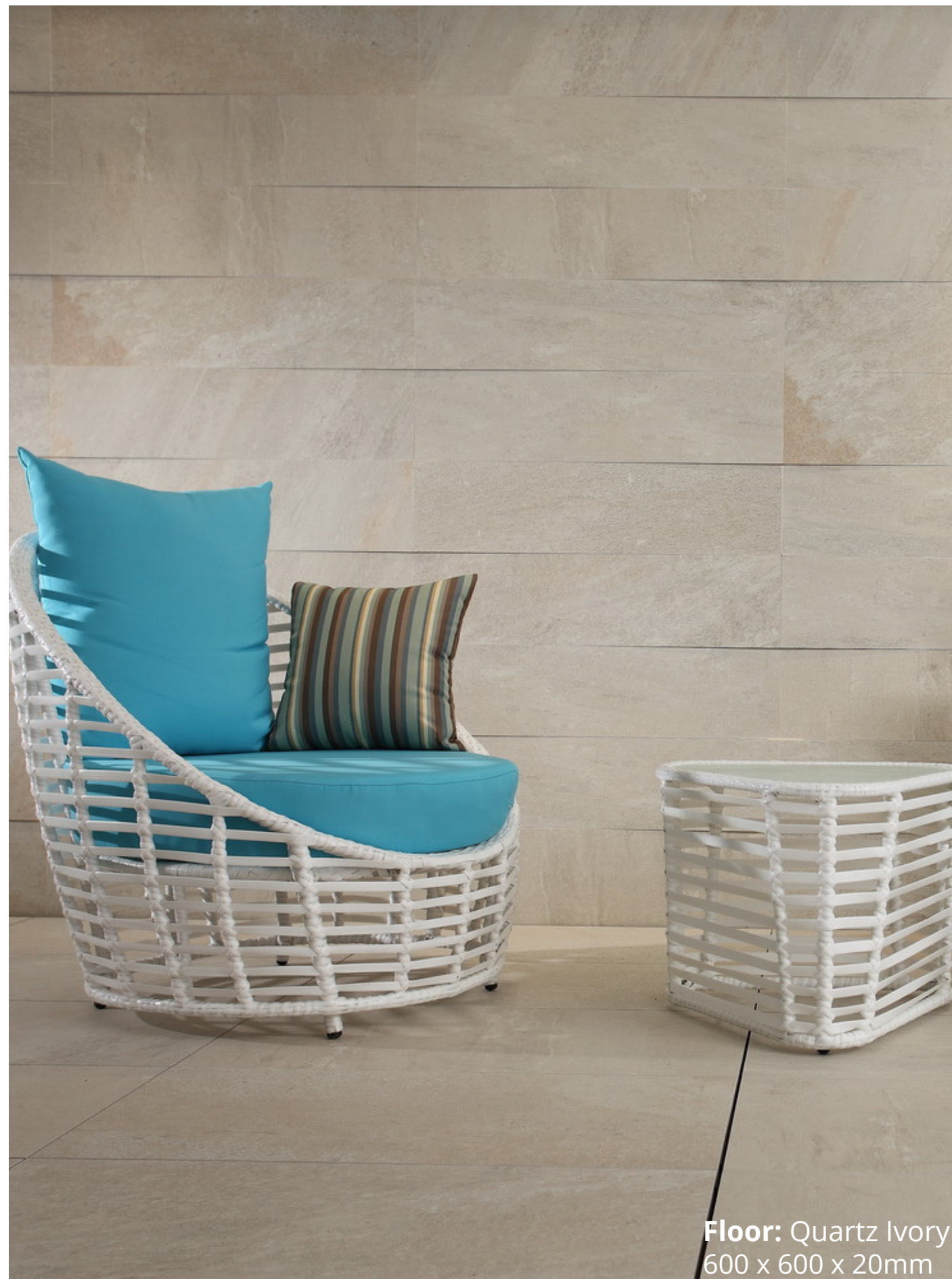
Floor: Quartz Ivory 600 x 600 x 20mm