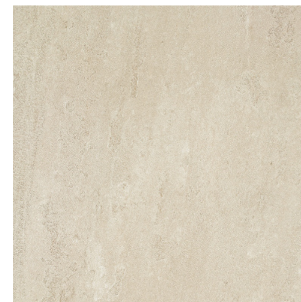
600 x 600 x 20mm 7745