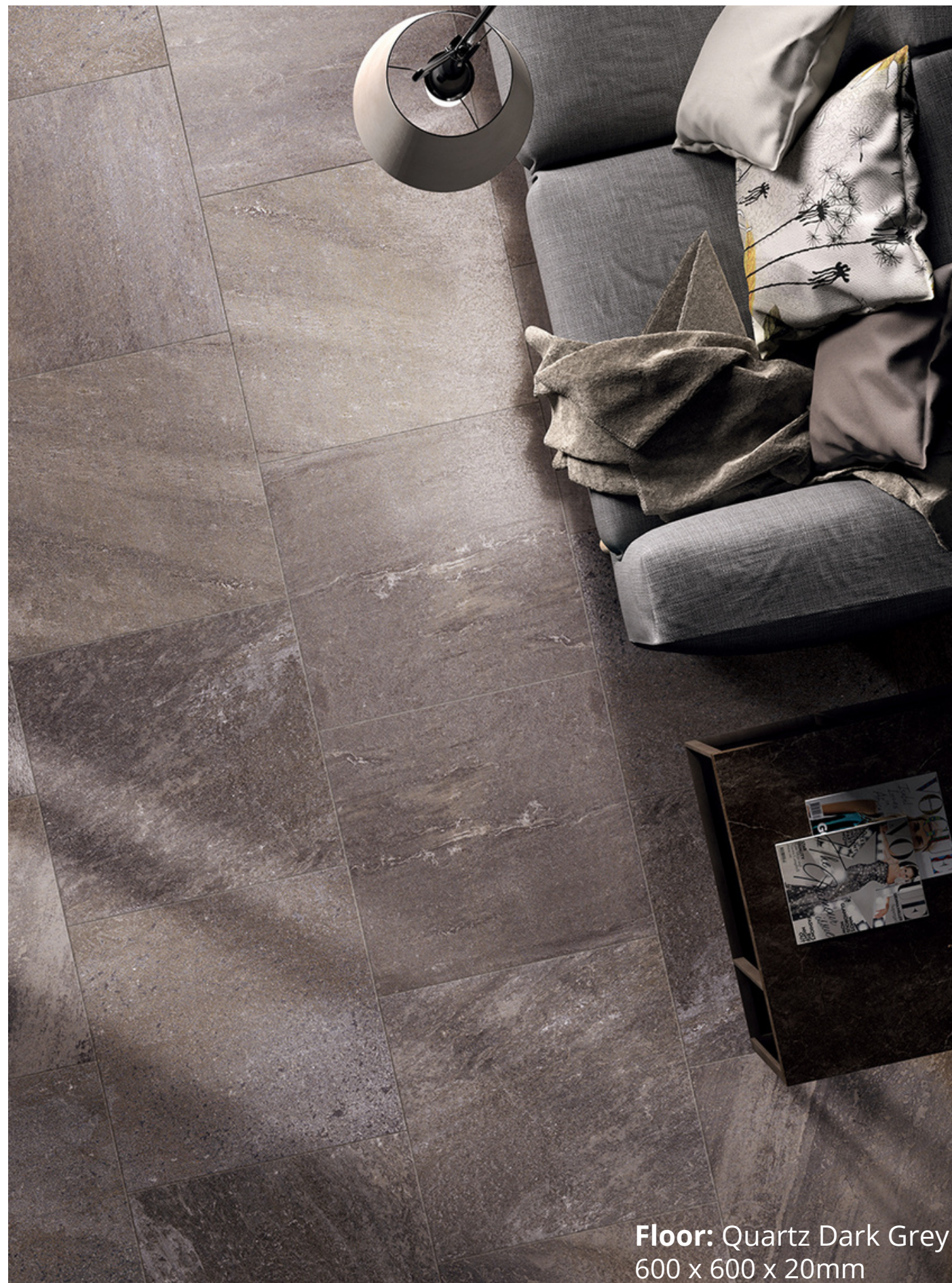
Floor: Quartz Dark Grey 600 x 600 x 20mm