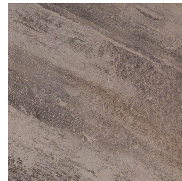
600 x 600 x 20mm 7675