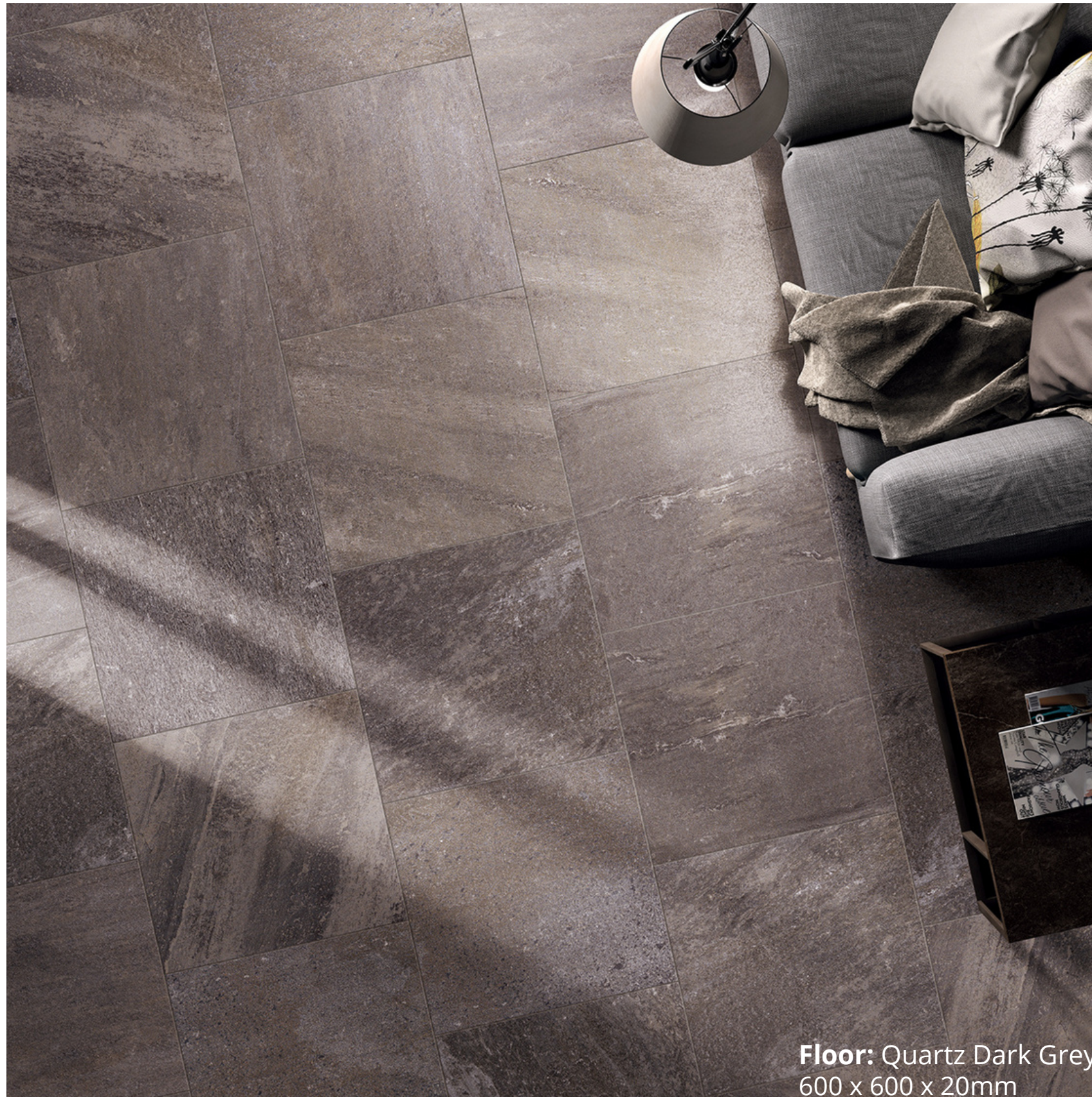
Floor: Quartz Dark Grey 600 x 600 x 20mm